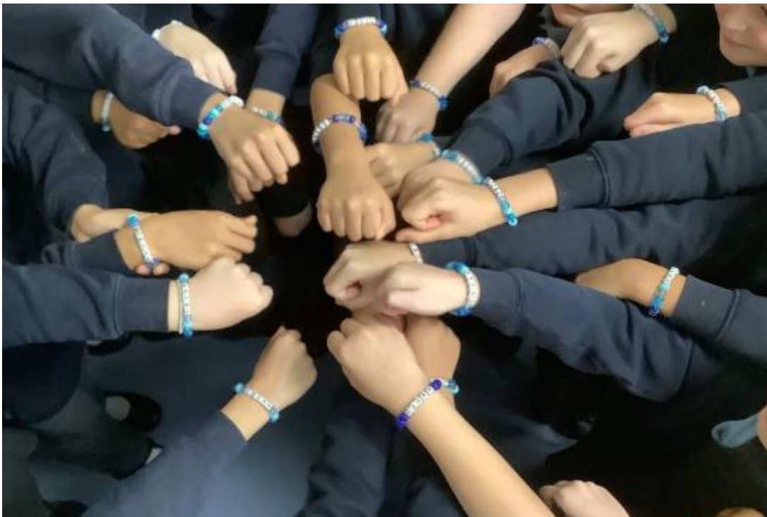
KS2 children have been exploring about The Amrit Ceremony and the Khalsa. They made bracelets to represent the union of being part of the class and how they support and care for each other.