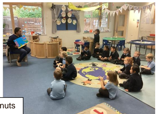
Parents leading story time for Chestnuts