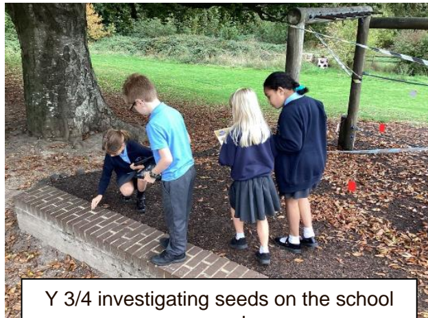
Y 3/4 investigating seeds on the school grounds

I hope you and your family are well. This first half term seems to have gone by in the blink of an eye and I can't quite believe that our next Newsletter will be in November. Life in school moves fast and the rhythms of the Autumn Term are well and truly under way. Here are some photos of recent learning: