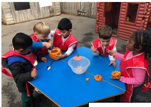
Diwali, investigating pumpkins and fancy dress day in