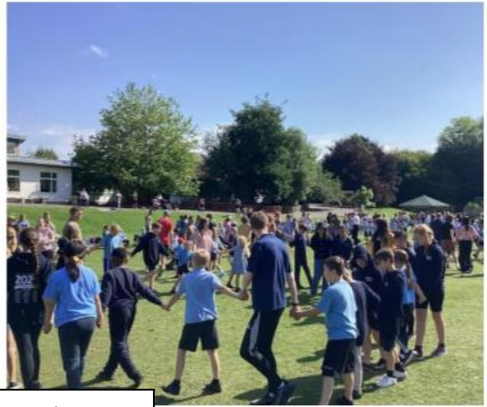
Downlands Dance Morning