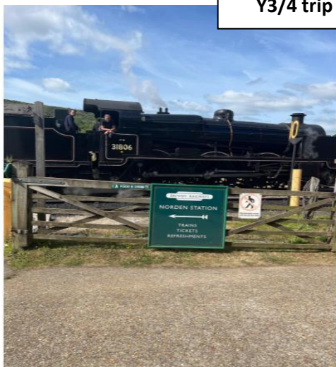
Y3/4 trip to Swanage